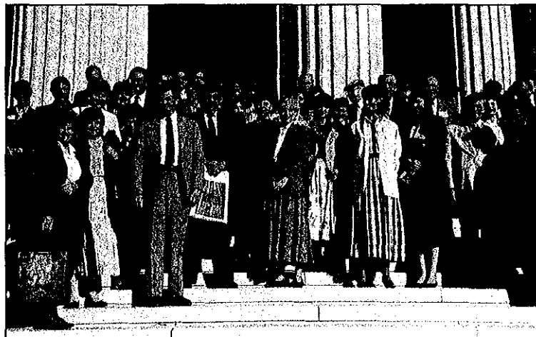
Conference attendees on the steps of the Supreme Court, where they met with Justice O'Connor.

Educational Program. The conference featured an extensive educational program. In a follow-up to the 1987 conference in New Orleans, Larry Stone explained how to develop a short videotaped presen-